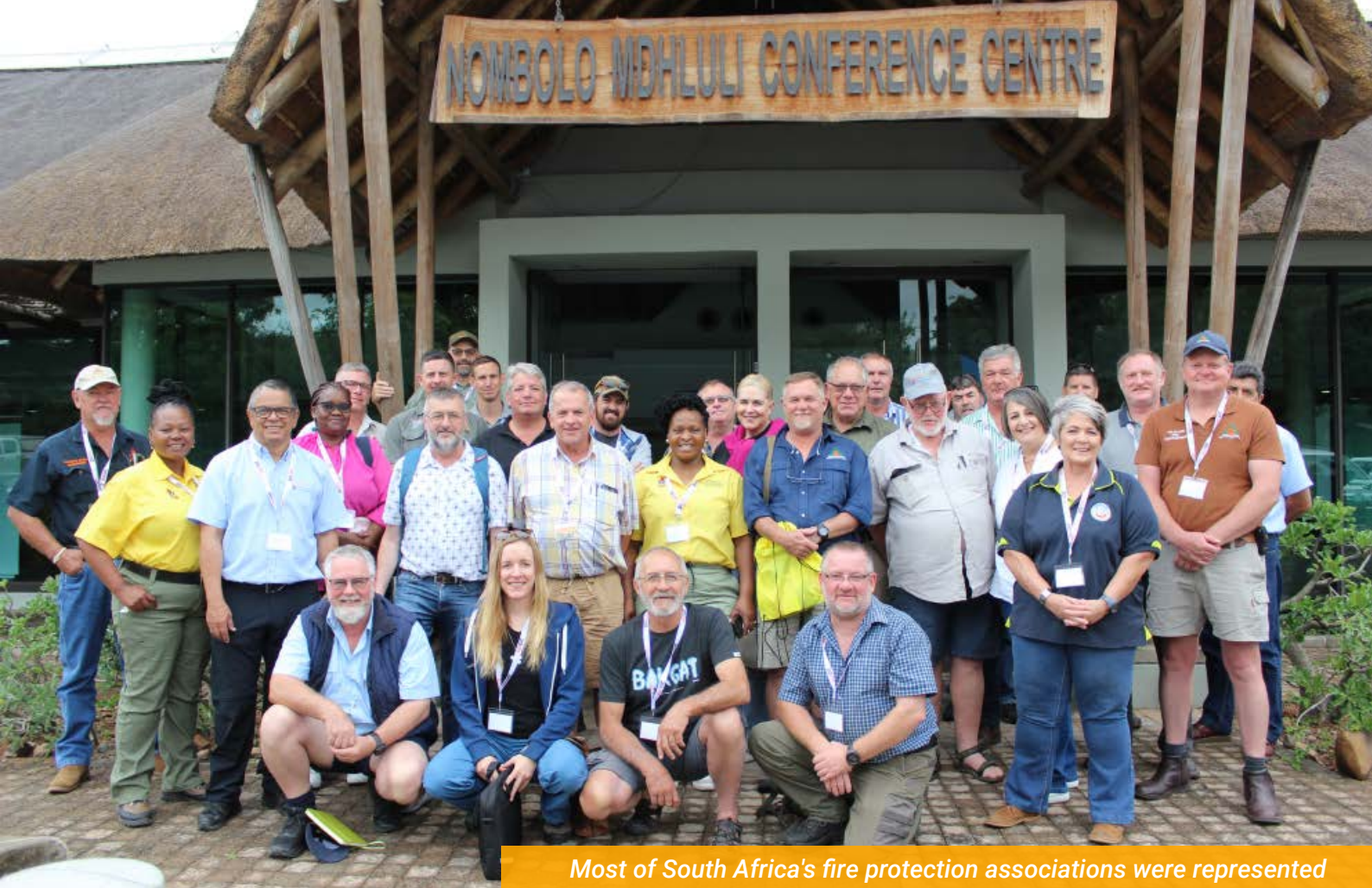
Most of South Africa's fire protection associations were represented