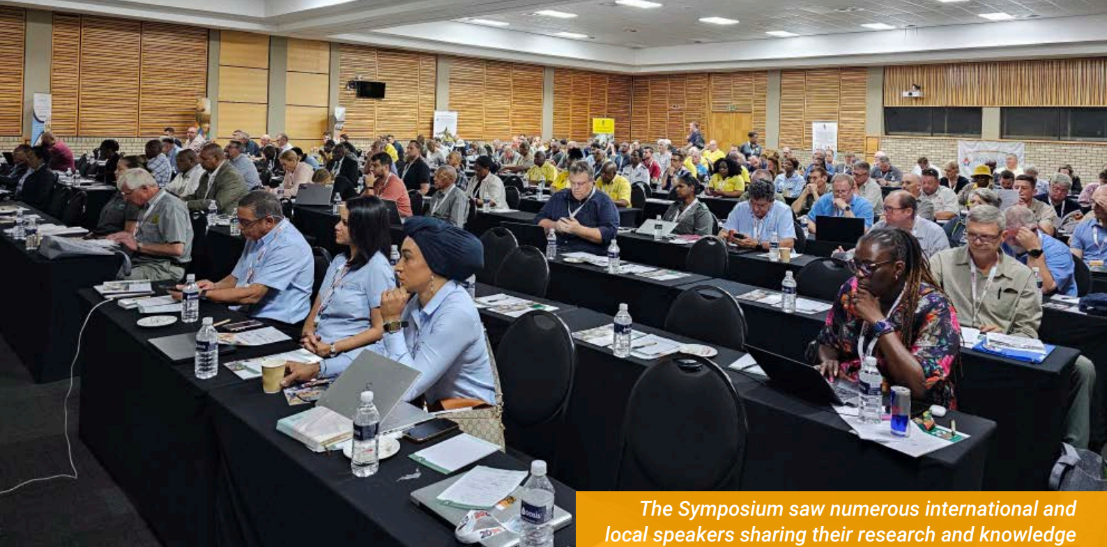
The Symposium saw numerous international and local speakers sharing their research and knowledge