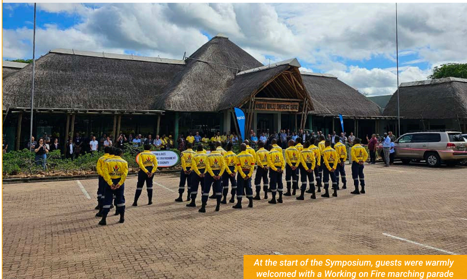
At the start of the Symposium, guests were warmly welcomed with a Working on Fire marching parade

W orking on Fire held its 20th Anniversary Fire Symposium in the Kruger National Park in Mpumalanga in partnership with the Nelson Mandela University George Campus and SANParks. The event was held at the Skukuza Conference Centre from 8 to 10 November 2023, with a field day with aerial and ground firefighting operations on 9 November 2023.